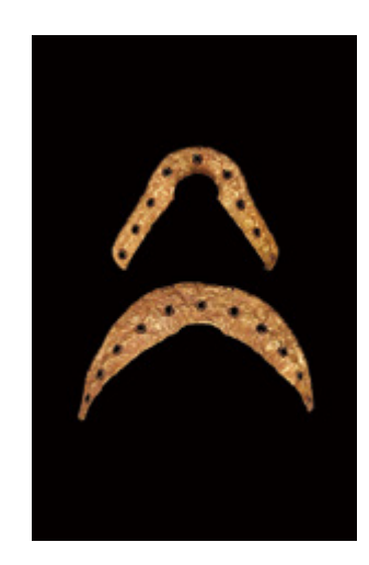
Gold saddle fitting with mythical animals Seventh to ninth century Mengdiexuan Collection