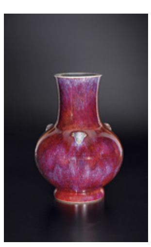
Vase with flambé glaze Qing, Qianlong reign (1736–95) Huaihaitang Collection