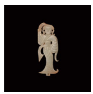
Pendant of a dancer Late Warring States period, 3rd century BCE H: 8.3 cm W: 3.1 cm D: 0.45 cm